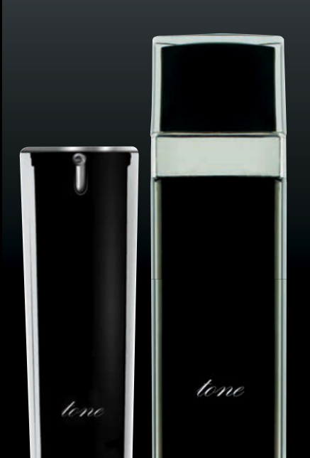
TONE BOTANICAL FIRMING TONER

A very gentle botanical toner containing Aloe Vera, Chamomile and Japanese green tea to rejuvenate the skin and Cucumber Extract to help tighten pores. Botanicals, extracts and marine minerals help promote skin firmness. Contains no alcohol.