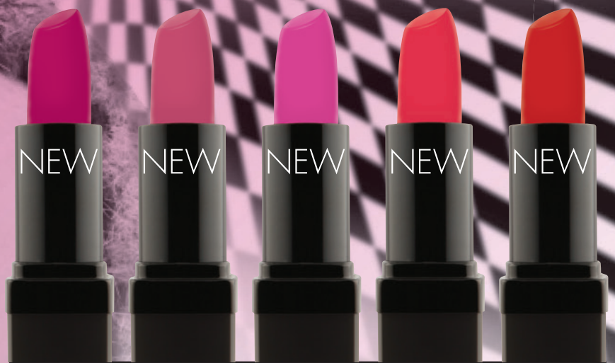
116 game on