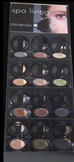
mineral pressed shadow/blush S4L

To see all our displays visit our website, new & improved, totally updated.