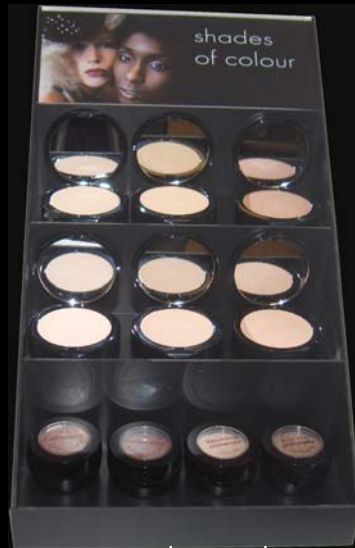
mineral pressed foundation/bronzer CF3