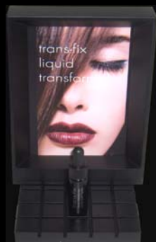
transfix display CSDSI/ cityscape VEO57B/ frame