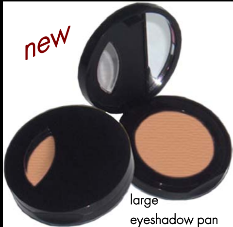
large eyeshadow pan